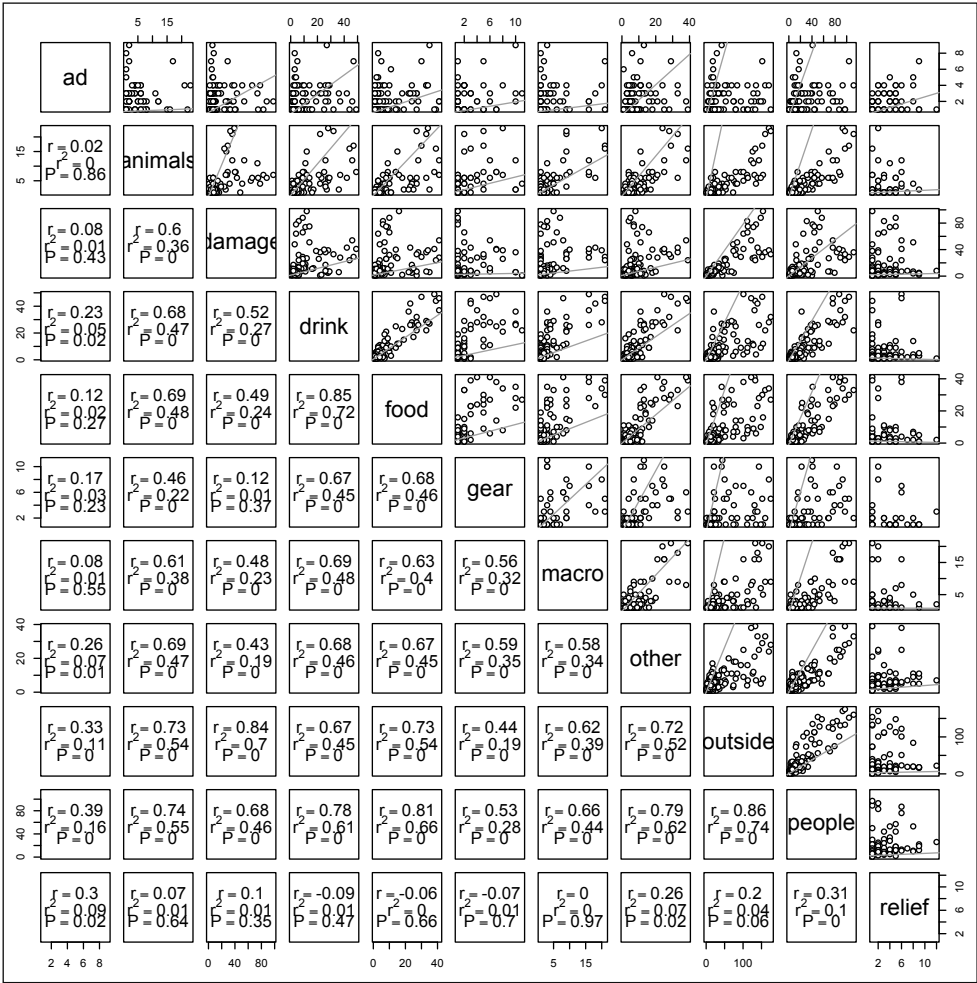
Figure 3: Correlations of all coded categories.

There are also several important instances of an absence of correlation. In particular, the lack of correlation between relief and macro is noteworthy as it signals a sort of taboo or no-go area regarding the Sandy relief efforts (especially the telethon). What emerges is an underlying understanding that relief efforts were a serious endeavour and key to larger, long-term post-Sandy recovery. The lack of correlation of relief with food and drink was expected as Sandy parties generally took place before US landfall. Every other category except for ‘ad’ has a significant level of correlation with macro, indicating that humour is widespread across Sandy-related motif categories, but not in the case of relief-oriented images. This is an important finding.