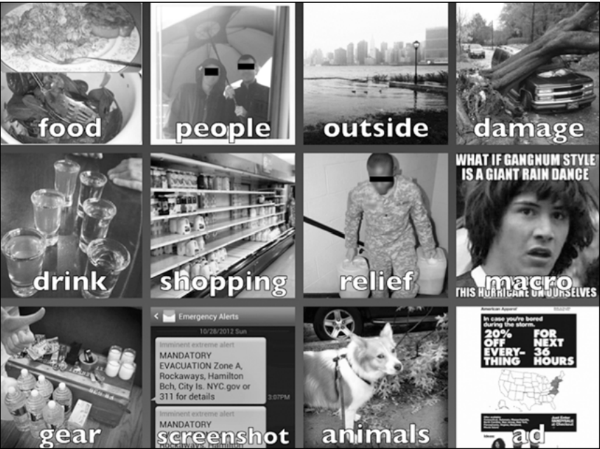
Figure 1: Examples of Instagram images by category.

Our data clearly illustrates that storm-related Instagram images are concentrated over a three-day period (see Figure 2). On the day of the storm, an increase in activity on Twitter occurred as users weighed in on the storm, including those far outside its path. This fits with previous work on Twitter and disasters which indicates Twitter frequency is generally highest the day a disaster hits (Hughes/Palen 2009). Unsurprisingly, the modal frequency of tweets was immediately after the US landfall of Hurricane Sandy (see Figure 2). Users at the peak of the storm, which occurred when Sandy made US landfall, were likely to post photos at a higher rate. On October 28, 2012, Instagram users posted photos regarding supplies for when the hurricane hit, ‘Sandy parties’ in restaurants and homes, and of friends and family. Sandy parties were common subjects of Instagram images. They featured groups of people eating and drinking before they had to face the predicted impact of Sandy. In terms of supplies to prepare for the storm (what we categorized as ‘gear’), it was clear that users felt anxious about how long the storm would be impacting the Eastern Seaboard. Many images were posted of storm rations, food, and forms of entertainment to keep people busy as they stayed indoors.